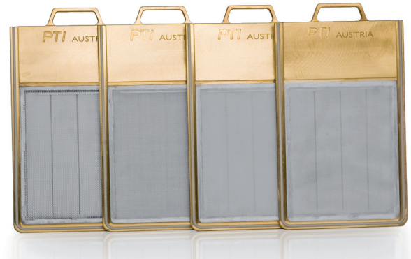
Classifier screens with different mesh sizes