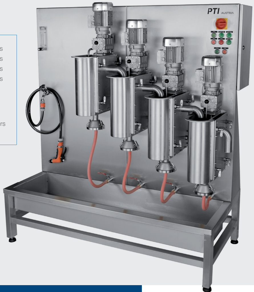
Model with 4 units

ASTM 16 / 30 / 50 / 100 / 200, others on request