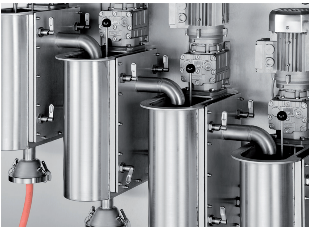
Classifier container with quick clamping device