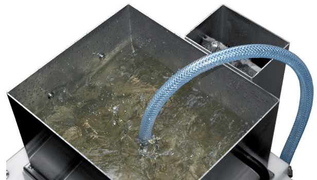
Standardised slot plate with a slot size of 0,15 x 45 mm