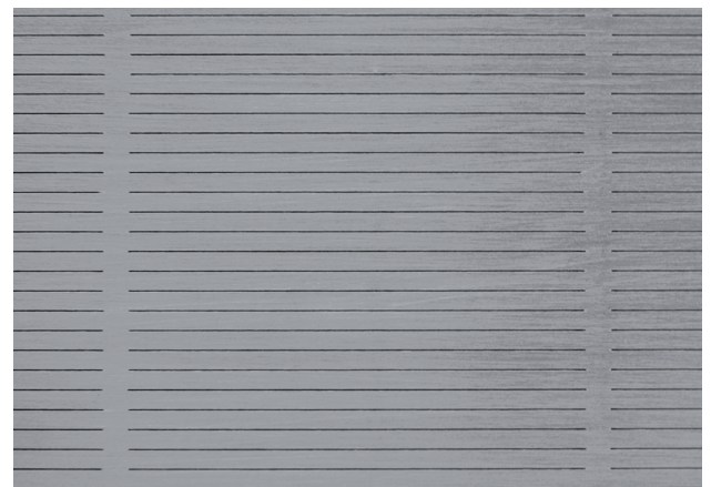
Standardised slot plate with a slot size of 0,15 x 45 mm