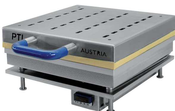
Model with a plate size of 350 x 350 mm