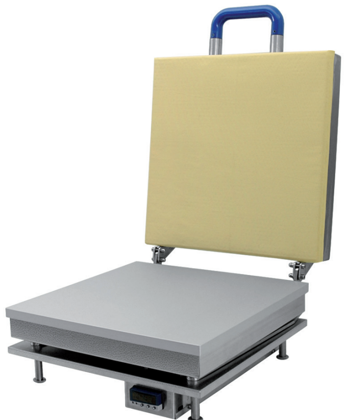
Adjustable heating plate with special alloy